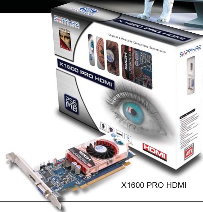
X1600 PRO HDMI